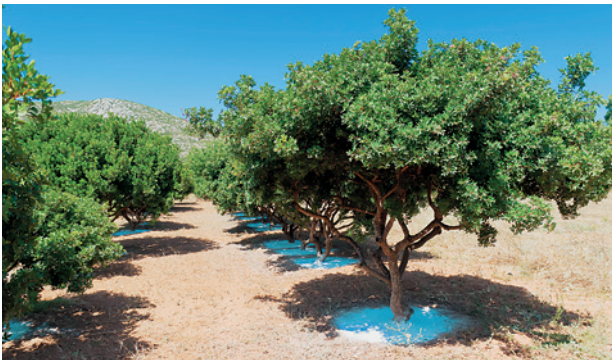
Plantation of mastix trees on the Greek island of Chios

In an initial study a cream with 2 percent PoreAway was tested for its efficacy in reducing open pores. Twenty women with skin having large open pores applied the test product to their cheeks on one side. The placebo cream, with no active, was applied to the other cheek. Before the first application of the creams, and after 2 and 4 weeks, silicon replicas of skin areas having large open pores were produced. The relief profile of the imprints was examined using the Primos system. A marked smoothing of the skin after 4 weeks of treatment with the PoreAway cream was clearly visible (s. fig. 1). The imprints of the skin's structure showed a clear reduction in the size of the pores (s. fig. 2). The Primos data were additionally evaluated in terms of the total surface area of the pores, with point-shaped pores penetrating deeply from the basic skin structure being separated. A significant reduction in the overall surface area of the pores was shown.